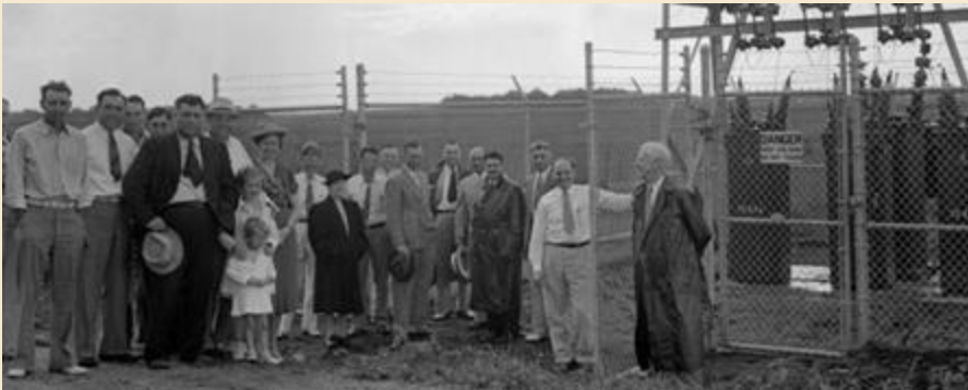
Com Belt Electric Co-op, Photo courtesy of the Mclean County Museum of History, Bloomington, IL